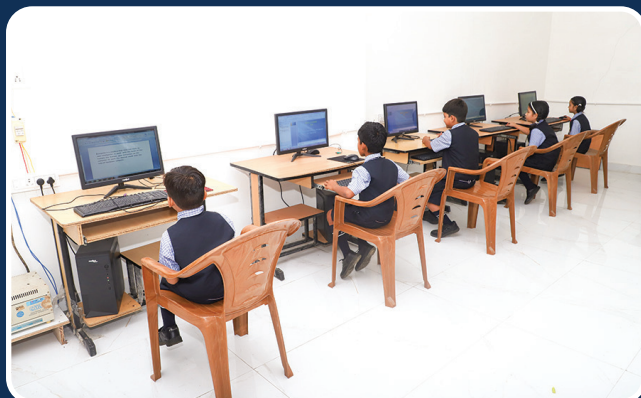
Advance computer lab fostering tech-savvy excellence