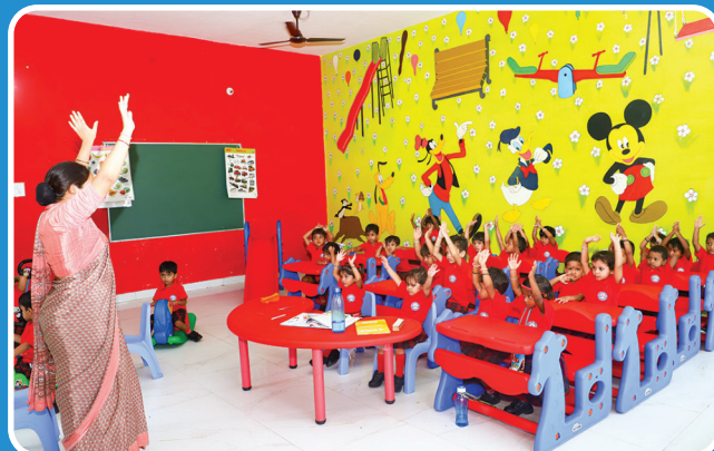
Skilled, and experienced staff