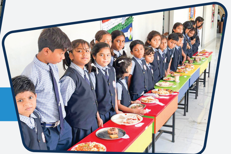
Food Without Fire competition at RPS showcasing their culinary skills.