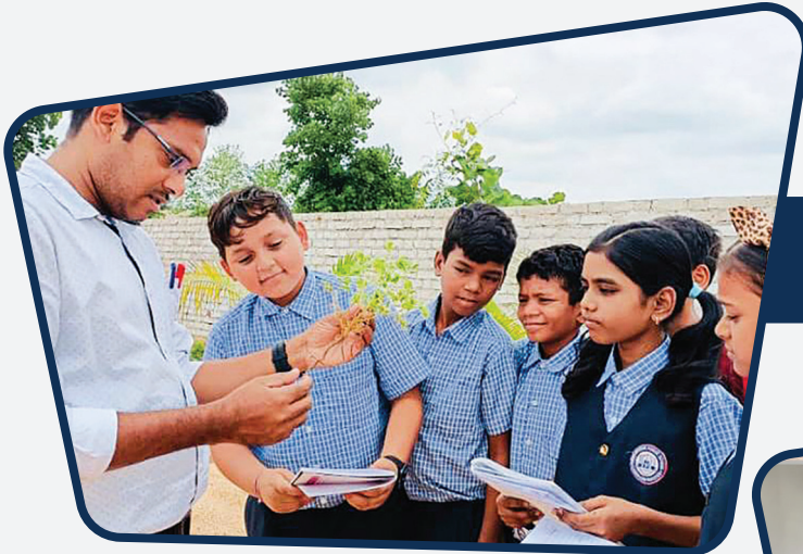
Farm visit : 7th and 8th graders explore agriculture and botany concepts.

Ramdarshan Public School offers a vibrant array of co-curricular activities to complement its academic curriculum. Students have the opportunity to engage in sports, performing arts, and visual arts. They can participate in inter-school competitions, cultural events, and sports meets. These activities promote physical fitness, artistic expression, teamwork, and leadership skills. Through co-curricular activities, students develop their talents, explore their interests, and enhance their overall personality. Ramdarshan Public School believes in the holistic development of students, fostering a well-rounded education that goes beyond the classroom. Here are glimpses of a few activities: