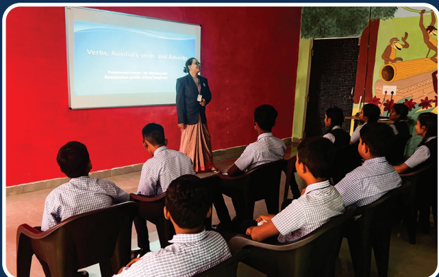
Innovative Tech-based interactive learning